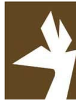
Cedar Brook Alpacas