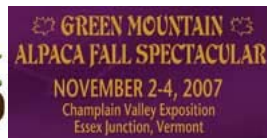
Paca Shack Farms