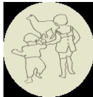
Cinco C's Alpacas